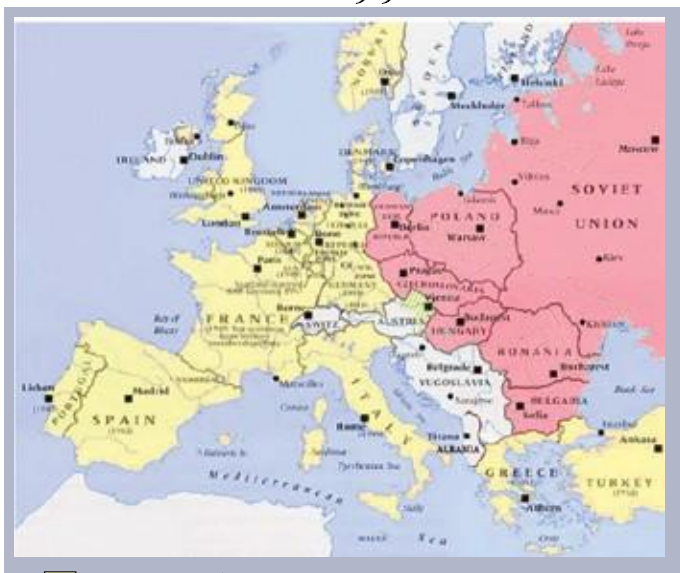
NATO and Warsaw Pact in 1989

NATO and the European Union also came in with initiatives and working programs tailored for the needs of the wider Black Sea region. With the accession of Bulgaria and Romania to NATO (2004) and the European Union (2007) both organizations became Black Sea powers and had to face the consequences of that new status.