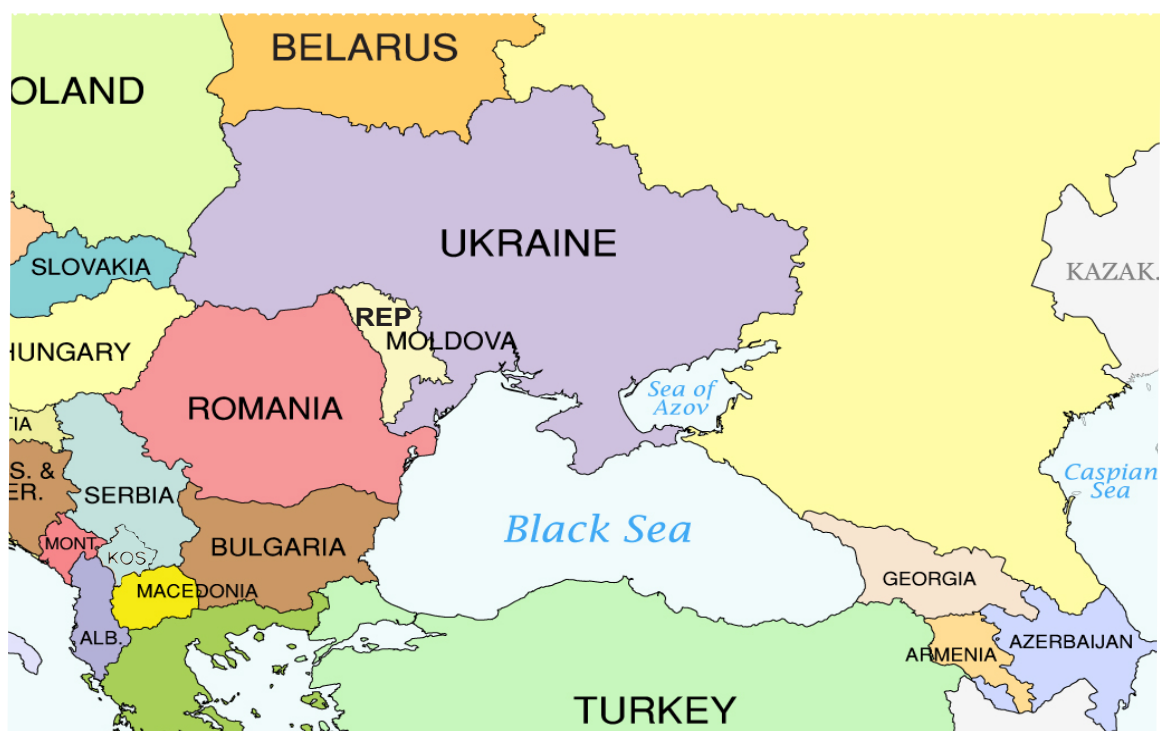
Black Sea region neighbouring countries

Viewed from Bucharest, Turkey has been a major regional actor for centuries and, in the past 25 years, has taken the lead in promoting a constructive, future-oriented agenda for the Black Sea region. Turkey's political, economic and military capacity entitles it to play such a role also in the future. Recent regional developments have brought home the notion that Turkey is also a significant actor in the Eastern Mediterranean and Middle Eastern space. In a statement that reflects the feelings of most Romanians, the President of Romania described Turkey as "indispensable ally for regional stability". This joint paper is intended as a meaningful contribution to the on-going intellectual dialogue designed to further strengthen the excellent bilateral relations between Romania and Turkey.