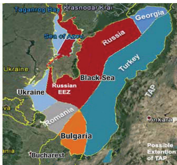
New exclusive economic zone delimitation in the Black Sea before and after the occupation of Crimea, the Russian vision