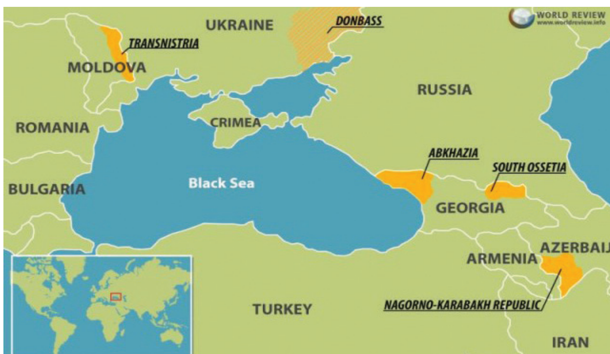
Frozen Conflicts in the Black Sea Area

In all those cases, what is 'frozen' today can become easily 'unfrozen' tomorrow, quickly degenerating into open military confrontation. Whenever such conflicts occurred, Russia promptly stepped in to stop hostilities for a while without addressing their root causes and typically introducing a 'temporary' peace-keeping force which never intended to leave the scene, thus securing a permanent Russian military presence. The experience of the past two decades has confirmed that Russian strategic planners are able to turn those conflicts on and off at will depending on Moscow's political and military interests at the moment. Whenever similar tensions arise in parts of the Russian Federation, they are dealt with and terminated ruthlessly; they are never 'frozen'. The perverse effects of such practices are seen in the political and societal weakening of the target states, exacerbation of internal divisions, economic stagnation and aid-dependence which may last for generations.