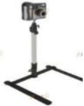
Cameră video mobilă